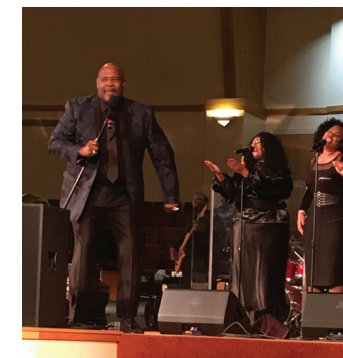
Grammy Winner Marvin Winans at Hallelujah for Heat Concert, Detroit