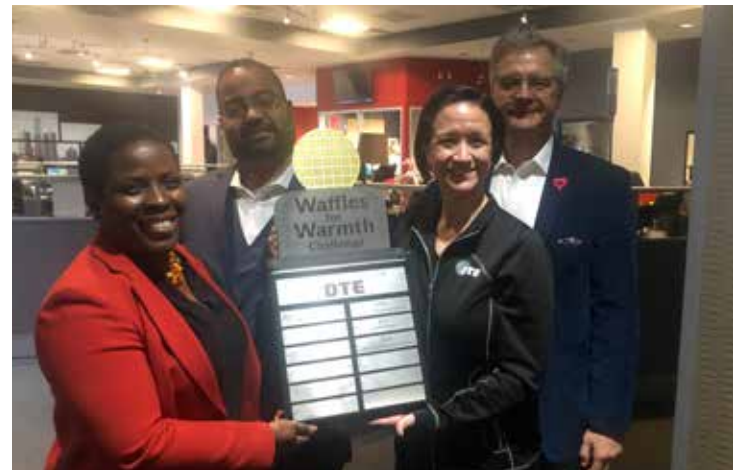
Waffles for Warmth is an annual employee fundraiser DTE hosts to raise money for THAW.