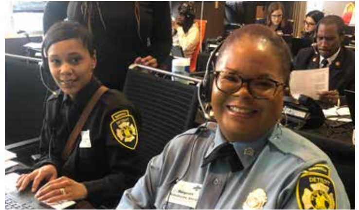
The Detroit Fire Department had a great team on the WWJ phones.