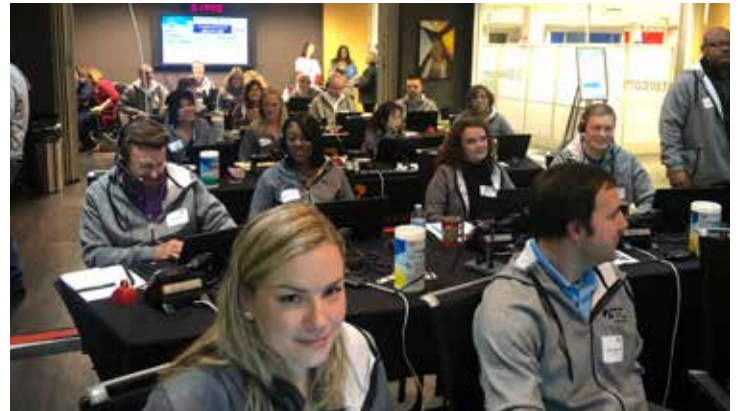
Every year, ITC Holdings kicks off the radiothon by answering the phones for the 5 a.m. shift.