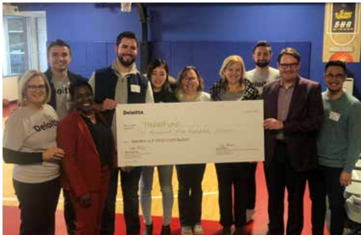
Deloitte raised $6,500 and donated its time and talents to validate all the pledges.