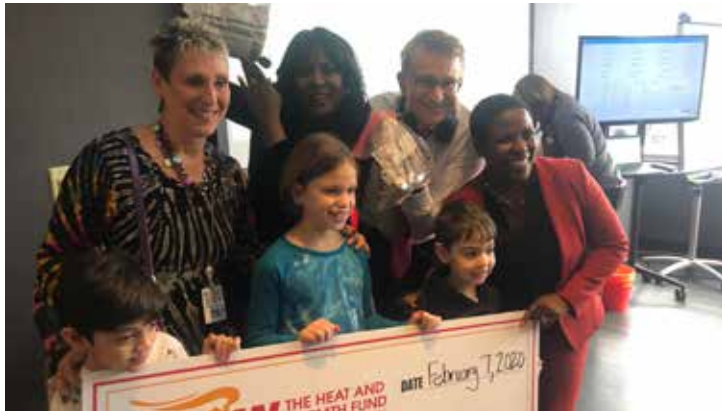
Lone Pine Elementary annually hosts "Pennies for Power" and this year they collected $1610.75 for THAW.