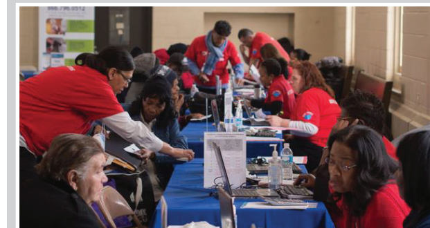
Customers receiving utility assistance at a Customer Assistance Day.

At Customer Assistance Days, we deliver energy efficiency education and hand out energy efficiency toolkits. The kits can save homeowners up to $340 a year. Through November, our outreach teams have held 62 Customer Assistance Days in six counties and distributed over 1,600 kits.